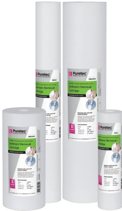
PX SERIES PERFORMANCE DATA